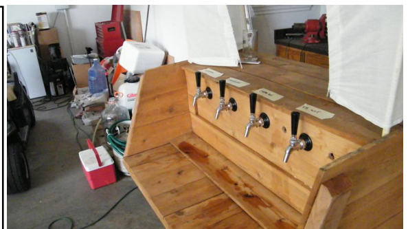
Right—The taps on hand for National HB Day at Shellman Haus. =====>