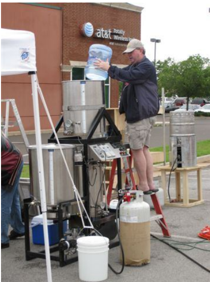
Left—The Really Old Boss getting the mash tun filled at Learn To Brew's 2nd Annual Big Brew Day as he starts brewing 15 gallons of American Pale Ale on a windy day. <=====