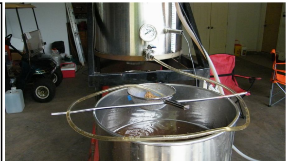
Right—Catching the grain bits as the boil kettle nears its full capacity after the mash tun collapse. =====>